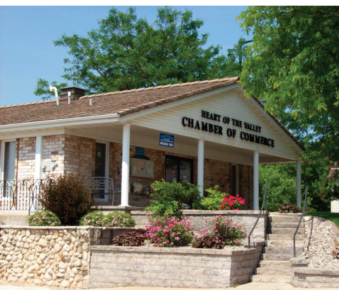
HEART OF THE VALLEY